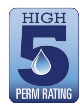
THE POLAR WALL PLUS! INSULATED SIDING SYSTEM HAS A PERMEABILITY RATING OF 5.0

Most homes are insulated between the wall studs, but the studs themselves are non-insulated. Energy can escape from inside the home through uninsulated studs, which account for nearly 25% of the wall's surface. Conduction through the wood framing can account for 40% of a wall's heat loss. The Polar Wall Plus! Insulated Siding System inhibits the conduction of energy through exterior wall studs, adds insulation and hinders air infiltration. It helps insulate the entire wall for energy efficiency and savings.